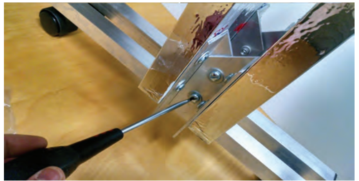
Assembled double mirror rolling floor stand.